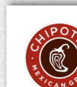
SCOTT BOATWRIGHT CEO, Chipotle

A handwritten signature in black ink, appearing to read "S. Boatwright".